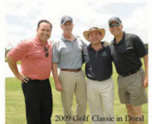
2009 Golf Classic in Doral