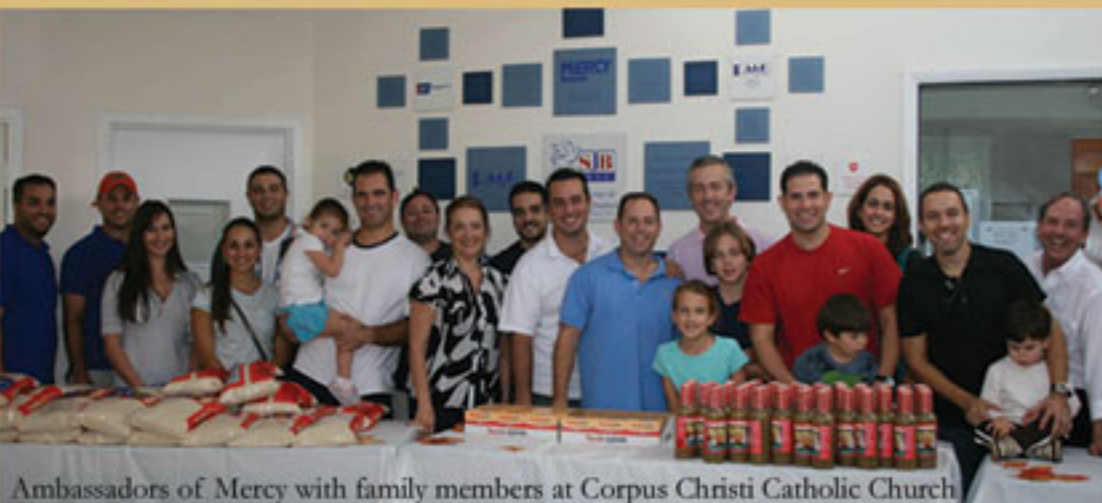
Ambassadors of Mercy with family members at Corpus Christi Catholic Church

teamed up with the Ambassadors to host the annual Food & Toy Drive at the St. John Bosco Clinic in East Little Havana, which helped more than 450 families in need. The Angels, who first started the event in 1993 as a food drive, collected groceries and donations while Ambassadors raised money to buy toys for children. Santa Claus, played by Univision's Raúl de Molina, even stopped by.