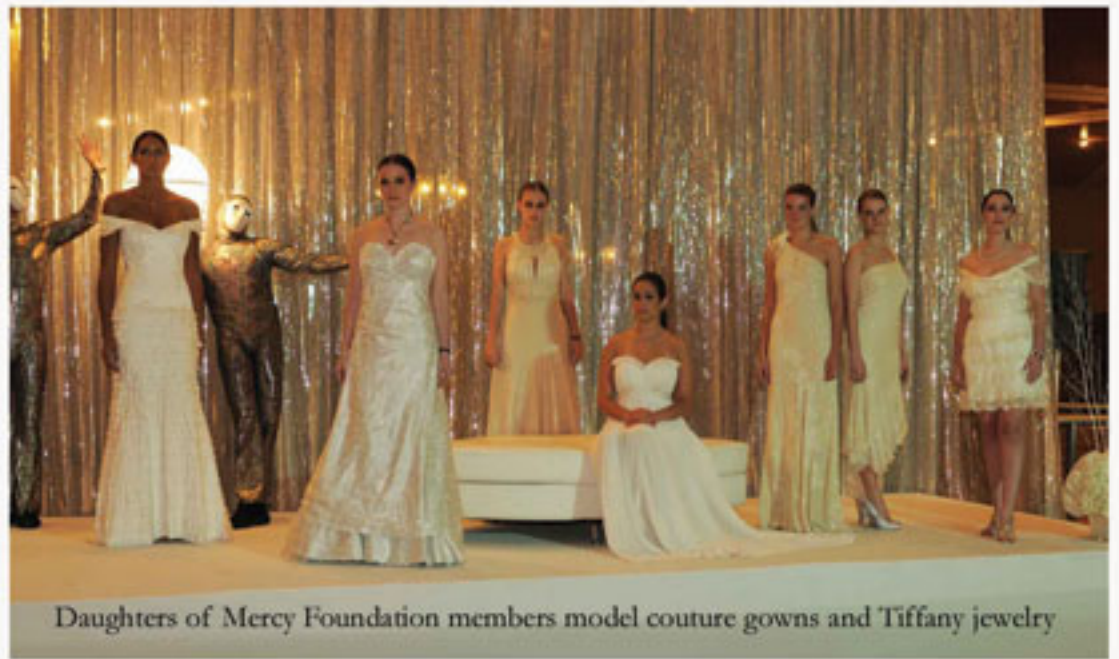
Daughters of Mercy Foundation members model couture gowns and Tiffany jewelry